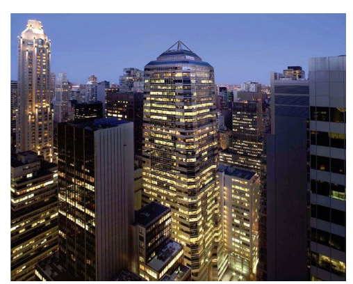
Park Avenue Tower NYC