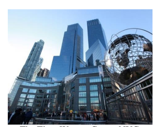
The Time Warner Center NYC